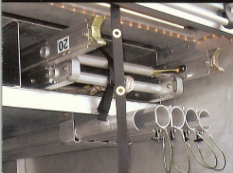
Ladders and pikepole storage