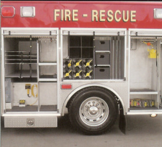
Wheel well compartment, pvc toolboxes, and bottle storage