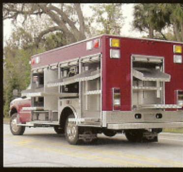
Trays and shelving with mission specific layouts