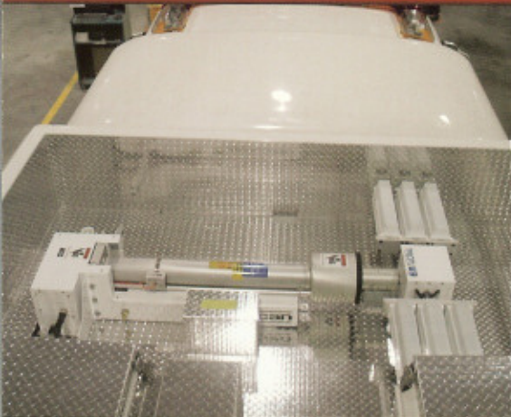
Recessed light tower mounting