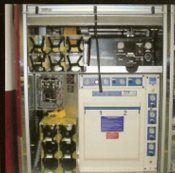
Breathing air fill station and storage

These are the typical specifications for the Walk Around Rescue: