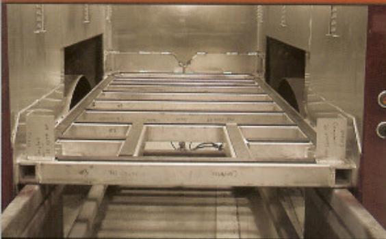
Self-supporting integral sub-frame for maximum strength