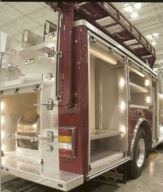
Versatility - multiple body configurations with up to 1000 gal tank capacity

These are the typical specifications for the American LaFrance Aluminum Pumper Bodies: