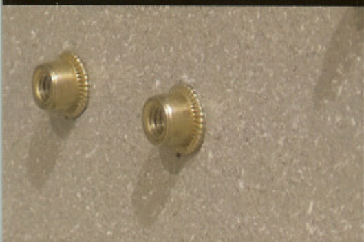
Threaded inserts provide maximum reliability

SCENE LIGHTING: Multiple truck mounted scene lighting available, including folding light towers, telescoping lights on the back of cab and body, or removable tripod lighting in 500W, 1000W, or 1500W light heads.