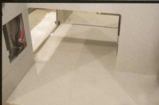
Transverse rear compartment with bolt-in divider option